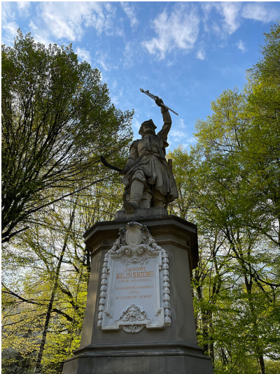
Monument to Jan Kilinski in Stryiskyi Park in Lviv (2022)