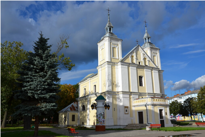
St. Joachims and St. Annes Church in Volodymyr-Volynskiy (2013)