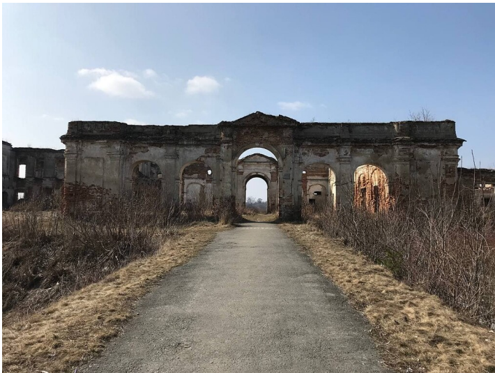
Front view of the wall connecting Sanguszko Palace and former Novozaslav Castle (2021)