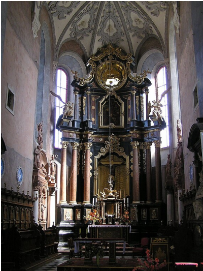
Interior of St. Lawrence Church in Zhovkva