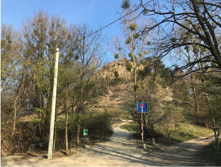
Leo Mountain in the Regional Landscape Park Znesinnya in Lviv (2021)