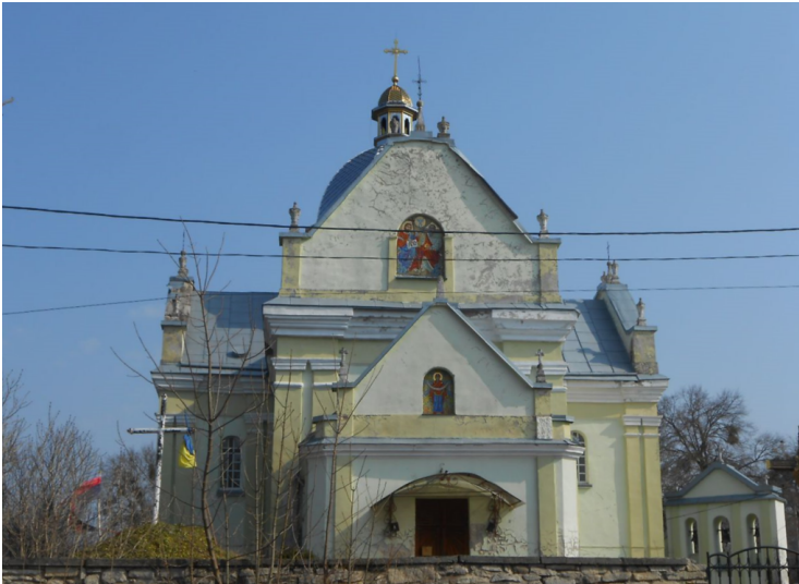
Church of the Holy Trinity and the Assumption of the Virgin in Svirzh (2021)